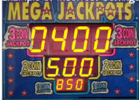
Example of Incorrect Settings

The 2 Coin Jackpot value and/or the 3 Coin Jackpot value are lower than the 1 Coin Jackpot value.