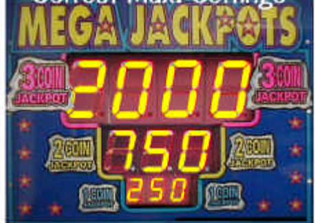
Correct Max. Settings

Note 1: Regardless if you set your game to a 40% POINT PAYOUT or 32% POINT PAYOUT , trust the factory